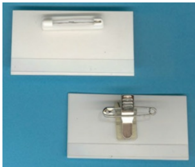
40mm x 75mm