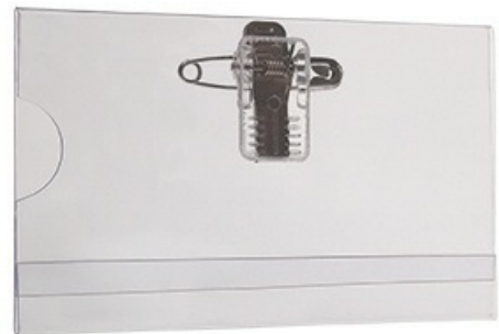
58mm x 92mm