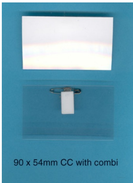
90 x 54mm CC with combi