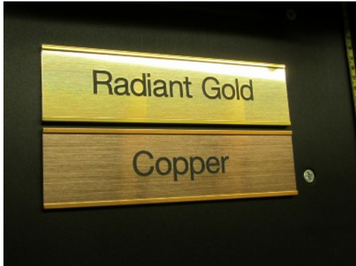
Aluminium holders with Engraved Laminate inserts